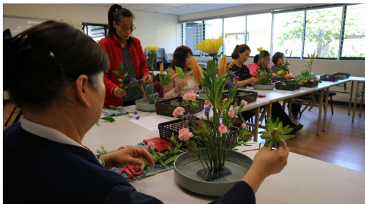
Community course – vegetarian class and flower arrangement. Both community courses had completed for this year.