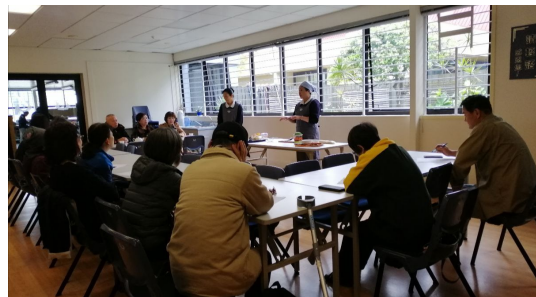
Most of the students became Tzu Chi volunteers. Thanks to the effort of volunteer teams who designed and developed the courses.